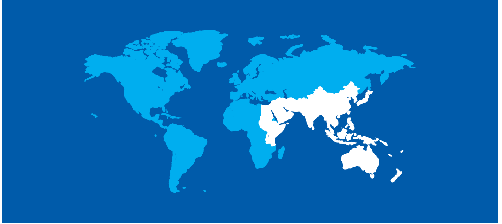
Illustration of Borouge's geographical focus, shown in white

Asia continues to motivate and inspire our development and growth.